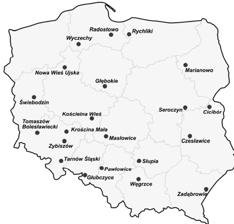
Figure 1. Locations of the Experimental Stations for Cultivar Testing in Poland within the network of COBORU stations where post-registration trials (PDO trials) for winter wheat were carried out across 2005-2007.