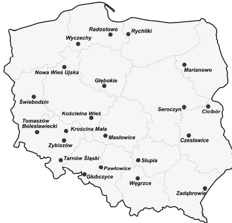
Figure 1. Locations of the Experimental Stations for Cultivar Testing in Poland within the network of COBORU stations where post-registration trials (PDO trials) for winter wheat were carried out across 2005-2007.